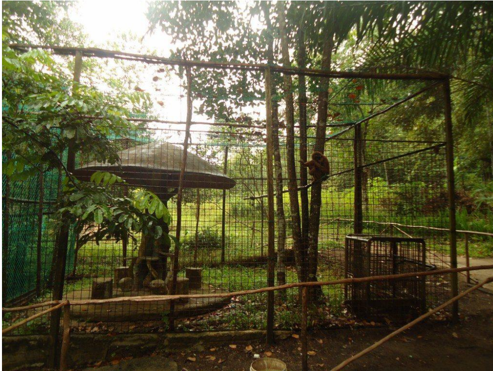
Mata Kucing Batam – Mini Zoo

There are various types of animal collections at Mata Kucing Batam. Some of them are crocodiles, snakes, turtles, several species of primates; monkeys, apes, brown gibbons and black gibbon. There are several species of birds such as Eagles, Cranes and Bird turtledove whose voice blared mutually to one another so as to create a melodious harmony of nature.