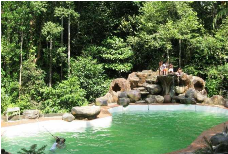
Mata Kucing Batam – Swimming area

If you want to feel the freshness of Mata Kucing forest, you could swim in the pool which is also available at this place. Visitors can feel the sensation of bathing, water play and refresh for a while in the forest area accompanied by a variety of forest vegetation and wildlife sound replication. This sensation will never be found in nature tourism in any area.