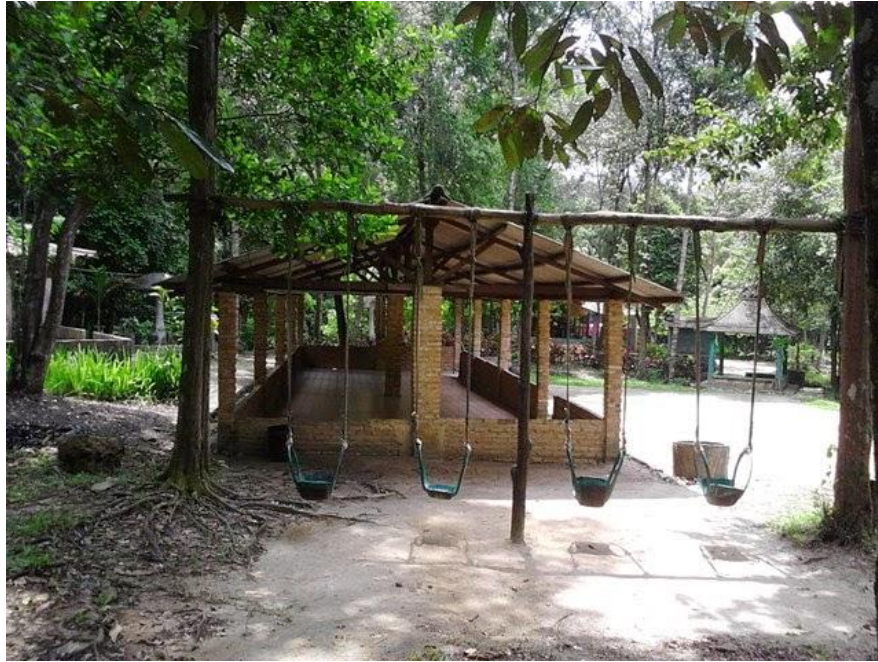
Mata Kucing Batam – Gazebo

If you want to feel the freshness of Mata Kucing forest, you could swim in the pool which is also available at this place. Visitors can feel the sensation of bathing, water play and refresh for a while in the forest area accompanied by a variety of forest vegetation and wildlife sound replication. This sensation will never be found in nature tourism in any area.